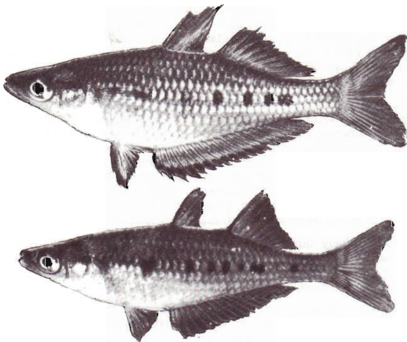
Fig. 1: Glossolepis maculosus , male holotype (upper), 46.2 mm SL and female paratype, 42.2 mm SL.

dorsal fin yellowish basally and anal fin with broad median band of yellow. The yellow coloration of the fins and body is more pronounced in males.